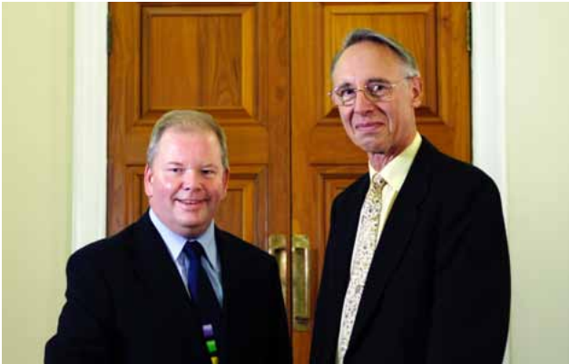
National Librarian and Chief Executive with the Chairman of the Board of Trustees