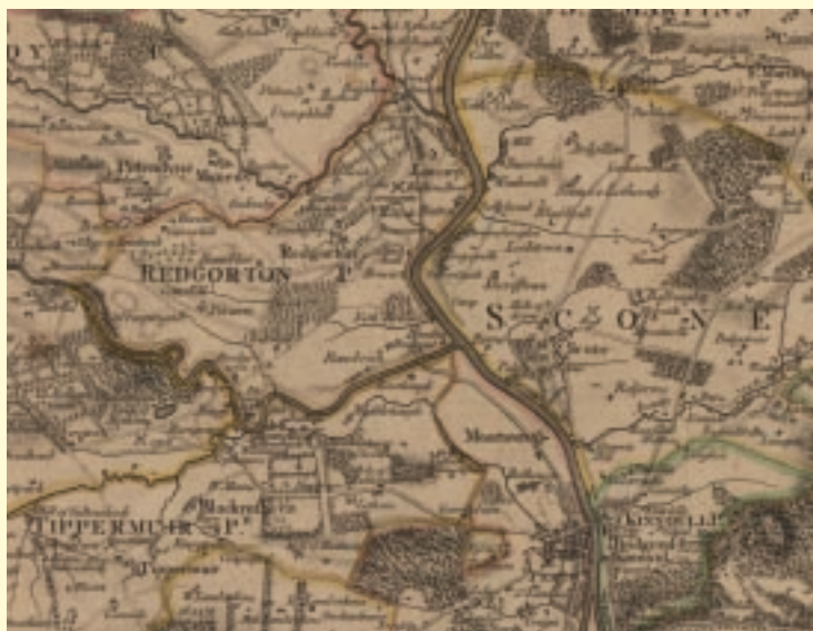
Detail from the map of the area north of Perth