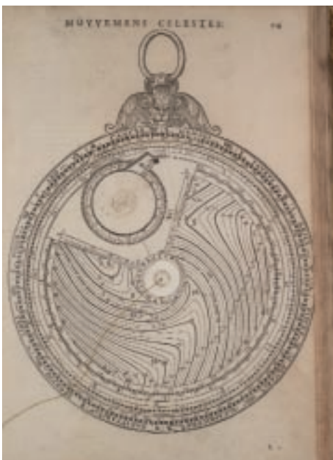
This volvelle, or set of movable wheels, rotates to calculate the position of Venus. From James Bassentin, Astronomique Discours (Lyon, 1557).