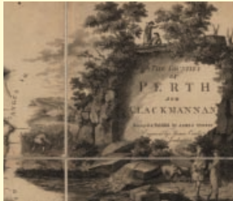
Title cartouche with illustration of Highland and Lowland gentlemen

Stobie acted as estate factor to the 4th Duke of Atholl, the largest landowner in Perthshire, for over 25 years from the late 1780s until 1804. In the early 1780s, the