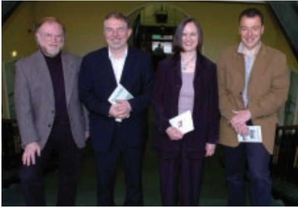
This year's Callum MacDonald Award winners