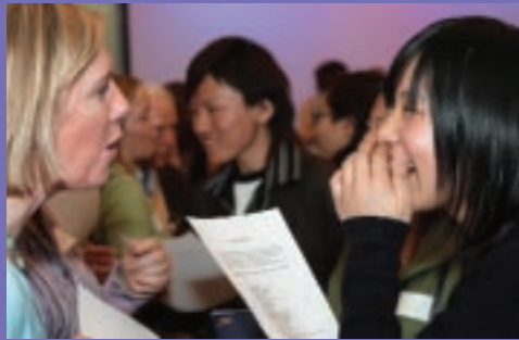
Visitors put 'the Questions' to the test

The Library made its first foray into polite speed-dating in May when the authors of The Questions: 101 ways to sort the pearls from the swine , came to show us how to put our social sleuthing skills to the test. The Questions offers people a fun method of gauging their compatibility with strangers, based around the answers they give to any number of preferences for everyday choices such as Monopoly or Scrabble? Nigella Lawson or Delia Smith? If you missed out on the fun and are intrigued to learn more, visit www.thequestions.co.uk for details of both classic and retro editions.