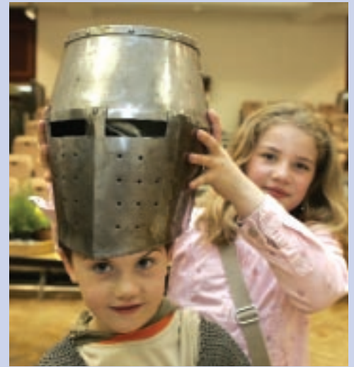
Young visitors at our Mediaeval Family Day

To accompany the Scotland's Secret War exhibition, classes are currently taking part in Spy Schools, learning the skills of a WW2 Secret Agent!