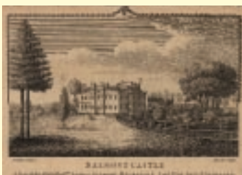
Top: Atholl House Above: Belmont Castle