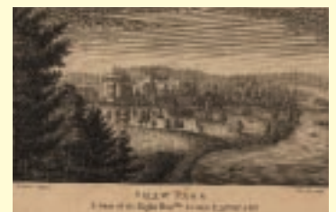
Top: Dunkeld Above: Shaw Park