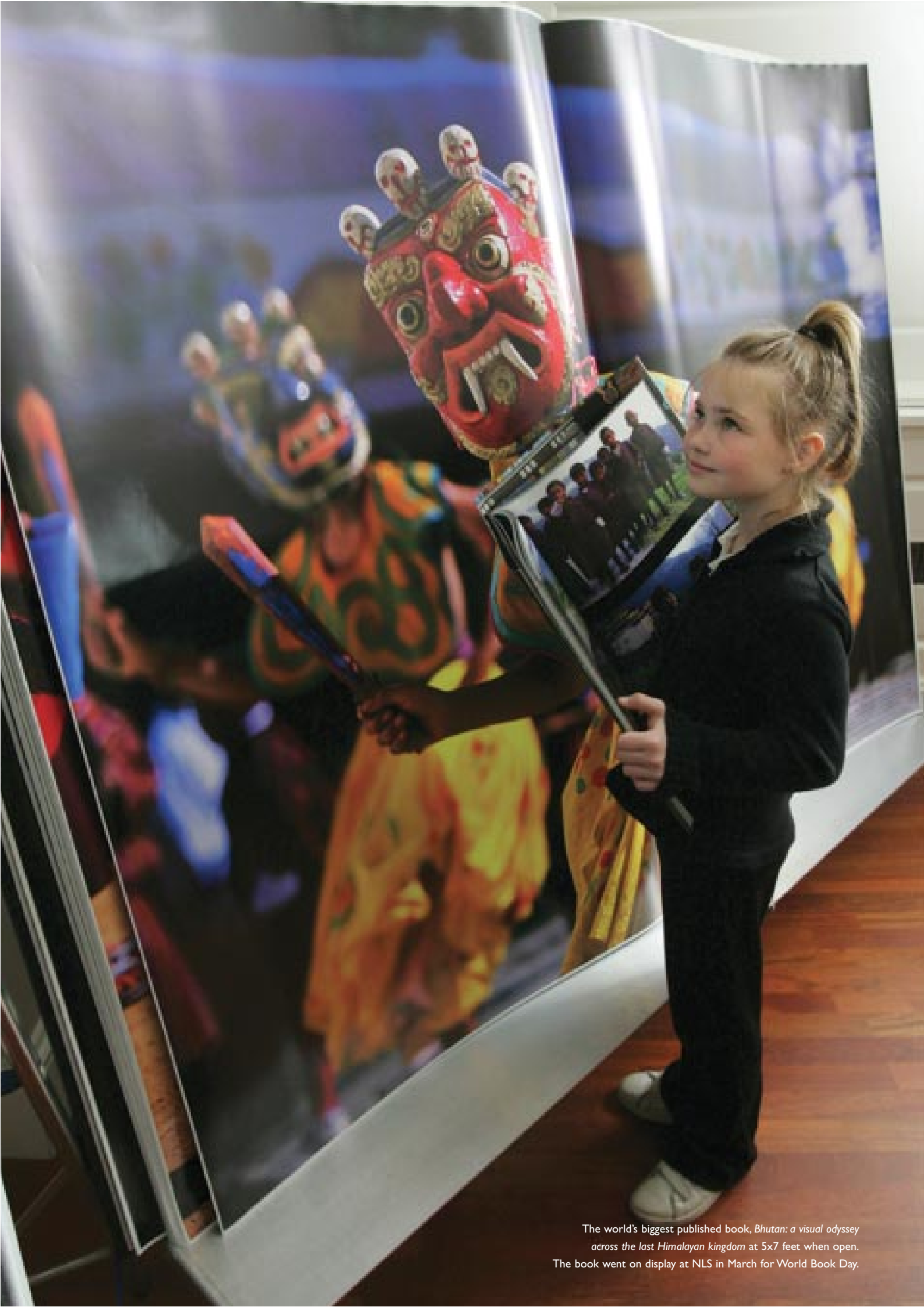
The world's biggest published book, Bhutan: a visual odyssey across the last Himalayan kingdom at 5x7 feet when open. The book went on display at NLS in March for World Book Day.

OUR recently published new strategy, Expanding our Horizons , picks up where its predecessor, Breaking through the Walls , left off. In the refreshed strategy, we give an update on the progress we have made in the past four years and we set out our plan to improve what we offer and how we will further develop services over the next three years. One major strategic addition to our list of corporate values is to encourage and pursue innovation across all areas of the Library's work. We have made a commitment to pursue bright ideas that will move us forward.