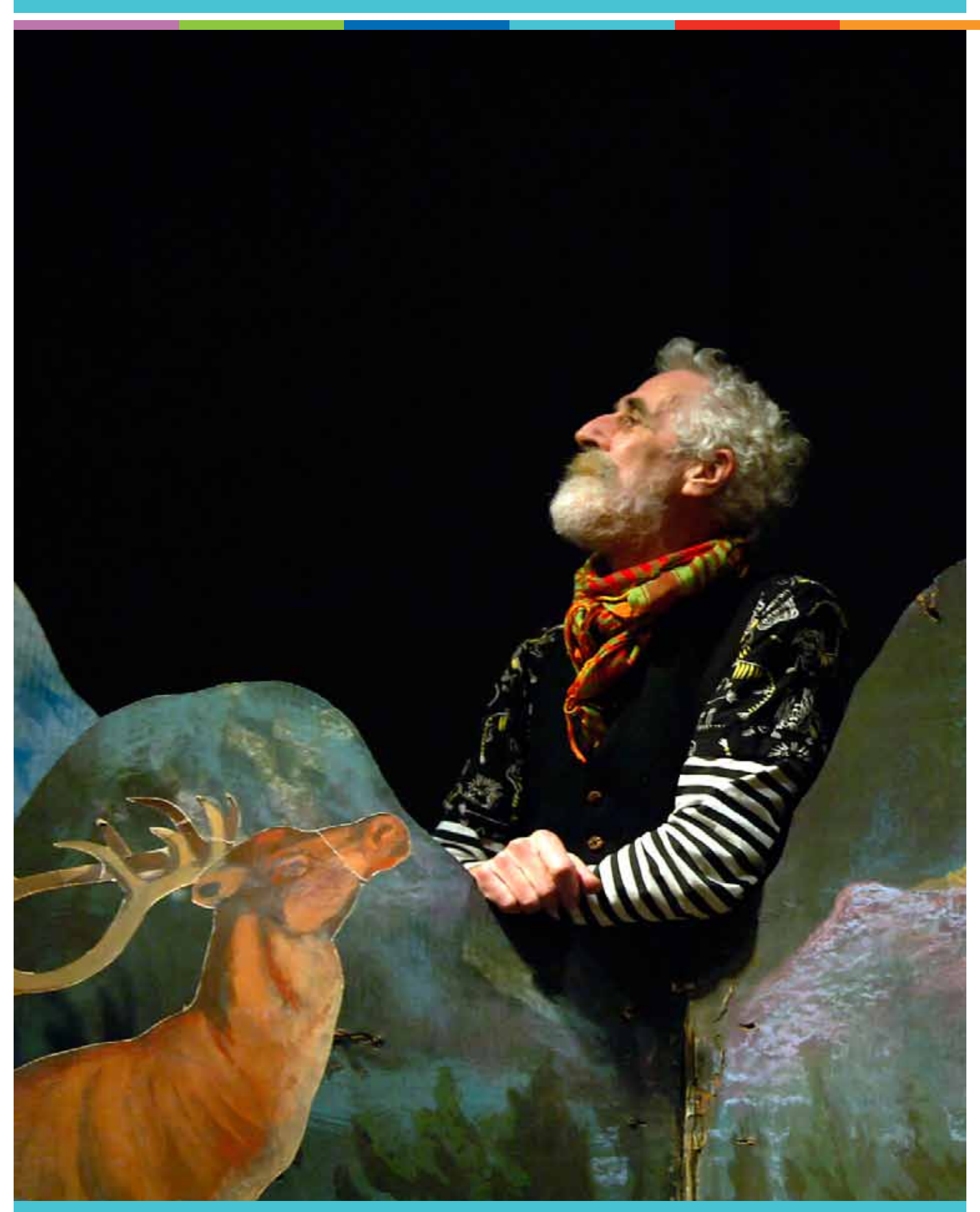
The National Library of Scotland is a registered Scottish charity Scottish Charity No. SCO11086