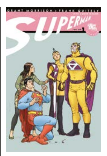
The Glasgow-born artist has also created striking artwork for DC's 'Superman', above, Dark Horse's 'Shaolin Cowboy', top right, and 'Candy Transversal', below right

"Some people had brought me gifts and some people told me stories about how they'd been following my work since they were 10 and now they were trying to get into comics themselves... [my wife] kept leaning over and tapping me in between people and saying, 'what do you not like about this?'.